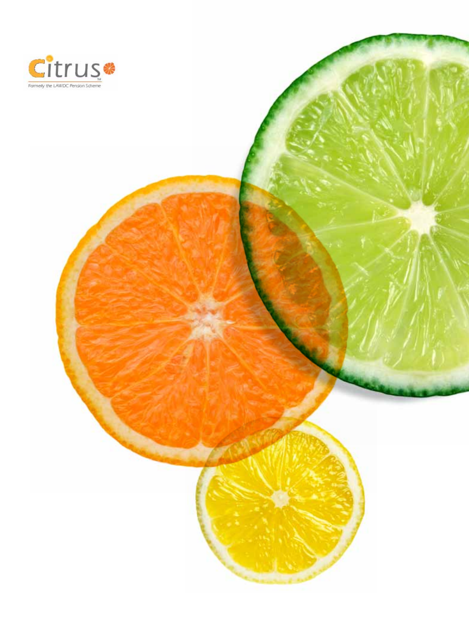
The Citrus Pension Plan Level 8 Member's Guide

CIT1301_Level 8 Booklet_v4.indd 16 23/01/2013 10:51